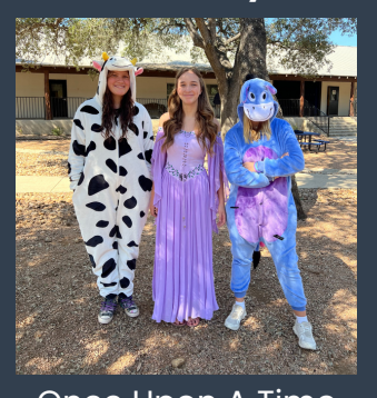
Once Upon A Time